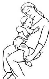
(infants & toddlers)

Numbing cream must only be put on intact skin. Do not put over a wound, rash or blister. Do not wash the skin before putting it on. The cream works best with the skin's natural oils. Ask your child's healthcare provider if you are not sure which area(s) of skin will be used for the needle stick. For immunizations, apply cream to the entire shaded areas on these most common locations: