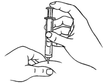
90 degree angle