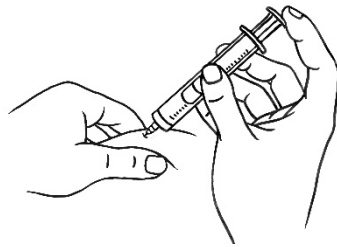
45 degree angle