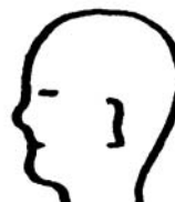
Left side of head