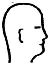
Right side of head