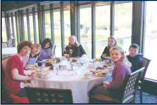
Children's Hospital and Regional Medical Center Ranks as One of Nation's Best

Recently U.S. News & World Report magazine placed Children's Hospital and Regional Medical Center among the nation's top children's hospitals for the 14th consecutive year. The results were announced as part of U.S. News & World Report's 17th annual "America's Best Hospitals" Index on newsstands July 10. Children's was ranked 12th in the country, and the only children's hospital in the Pacific Northwest to make the list.